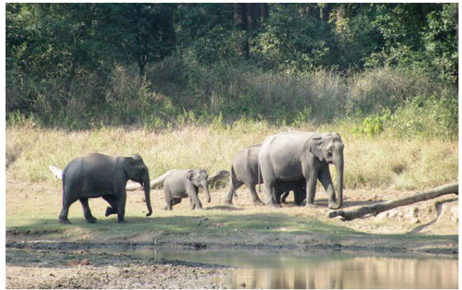
Rajaji National Park