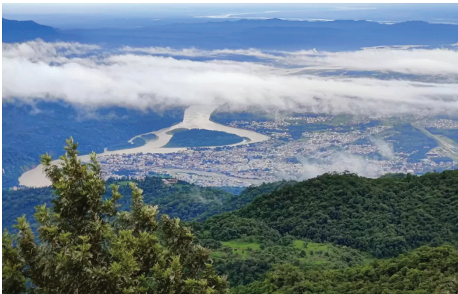
Rishikesh view from Narendra Nagar